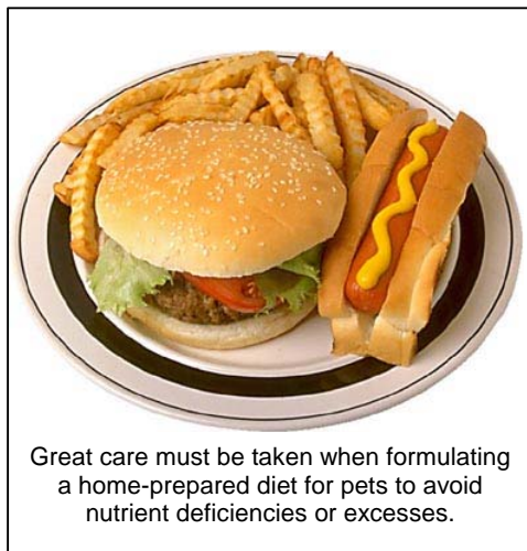
Great care must be taken when formulating a home-prepared diet for pets to avoid nutrient deficiencies or excesses.

Problems may occur if pet's diets are either under- or over-supplemented with certain vitamins and minerals. The most common imbalances in home-prepared diets involve calcium, phosphorus, zinc, magnesium, and iron. Animals with increased nutritional needs associated with growth or reproduction have different requirements for energy and nutrients, and require enhanced protein levels and optimal ratios of vitamins and minerals to support growth. The advice of a veterinarian with advanced nutritional knowledge is imperative to