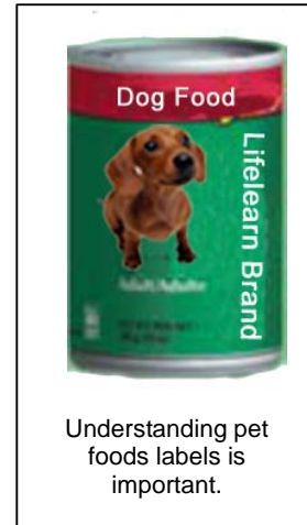
Understanding pet foods labels is important.

The ratios of individual dietary components in different recipes will vary considerably, and adhering to one recipe exclusively may cause severe nutritional imbalances. You should also avoid using recipes that are complicated or time-consuming to prepare, since you will be more likely to take shortcuts in the preparation. It is not enough to just feed a diet of table scraps, or to toss some meat, grains, and vegetables into a bowl for your pet. If you do that, your pet could end up malnourished.